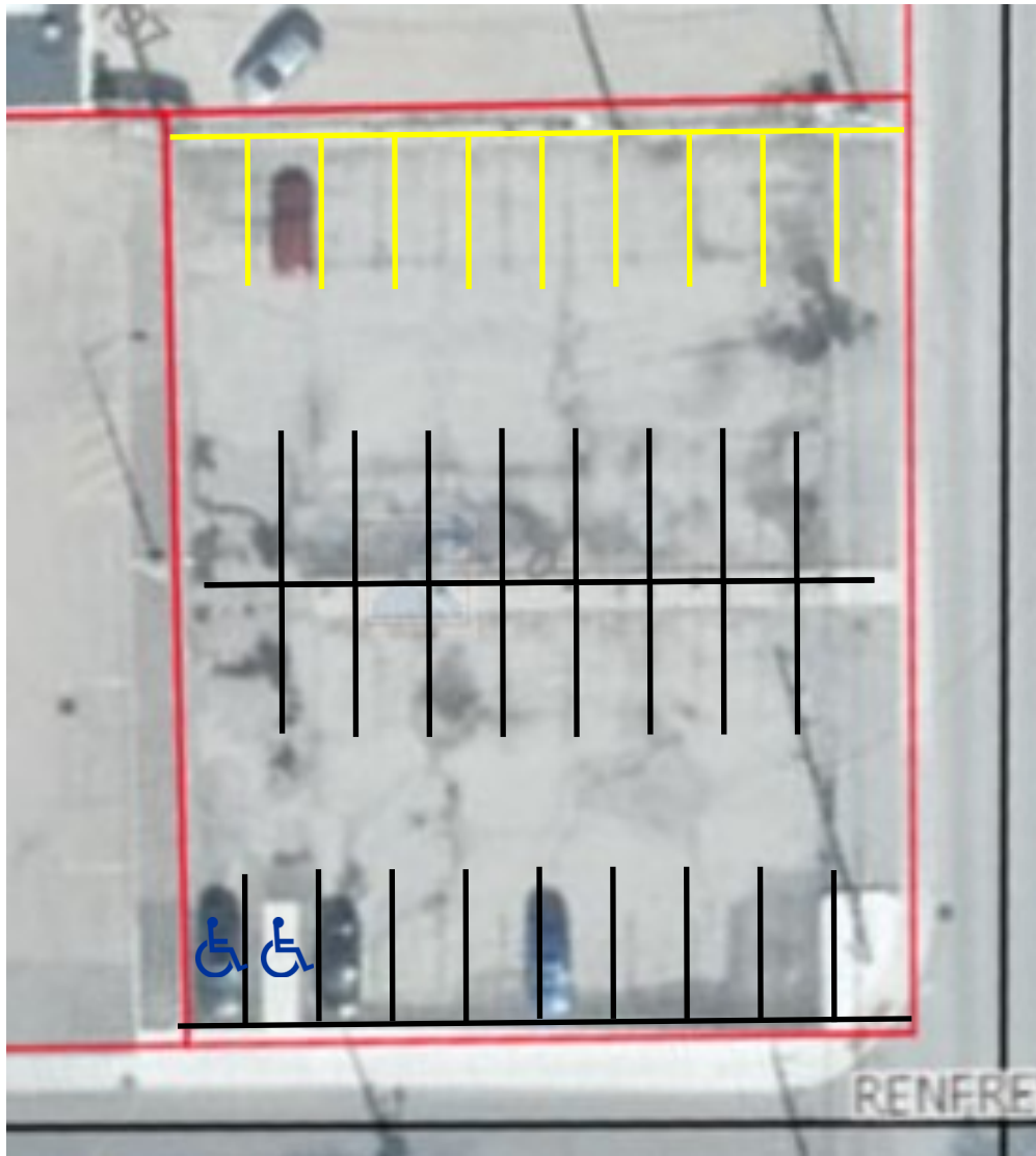
188 Plaunt Street South