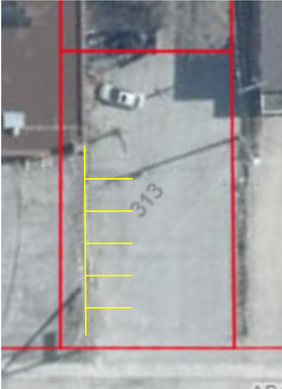
313 Argyle Street South